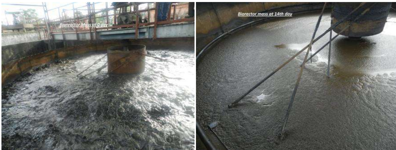
Bio-remediation facility of BGR

One old slurry thickener in ETP from Petrochemical section was converted to confined space bio-remediation reactor to treat oily sludge with help from IOCL-R&D. The process of bio-remediation started from July 2017. From 1 st April, 2023 to 30 th September, 2023 , 14.0 MT of oily sludge has been processed in the Bio-reactor.