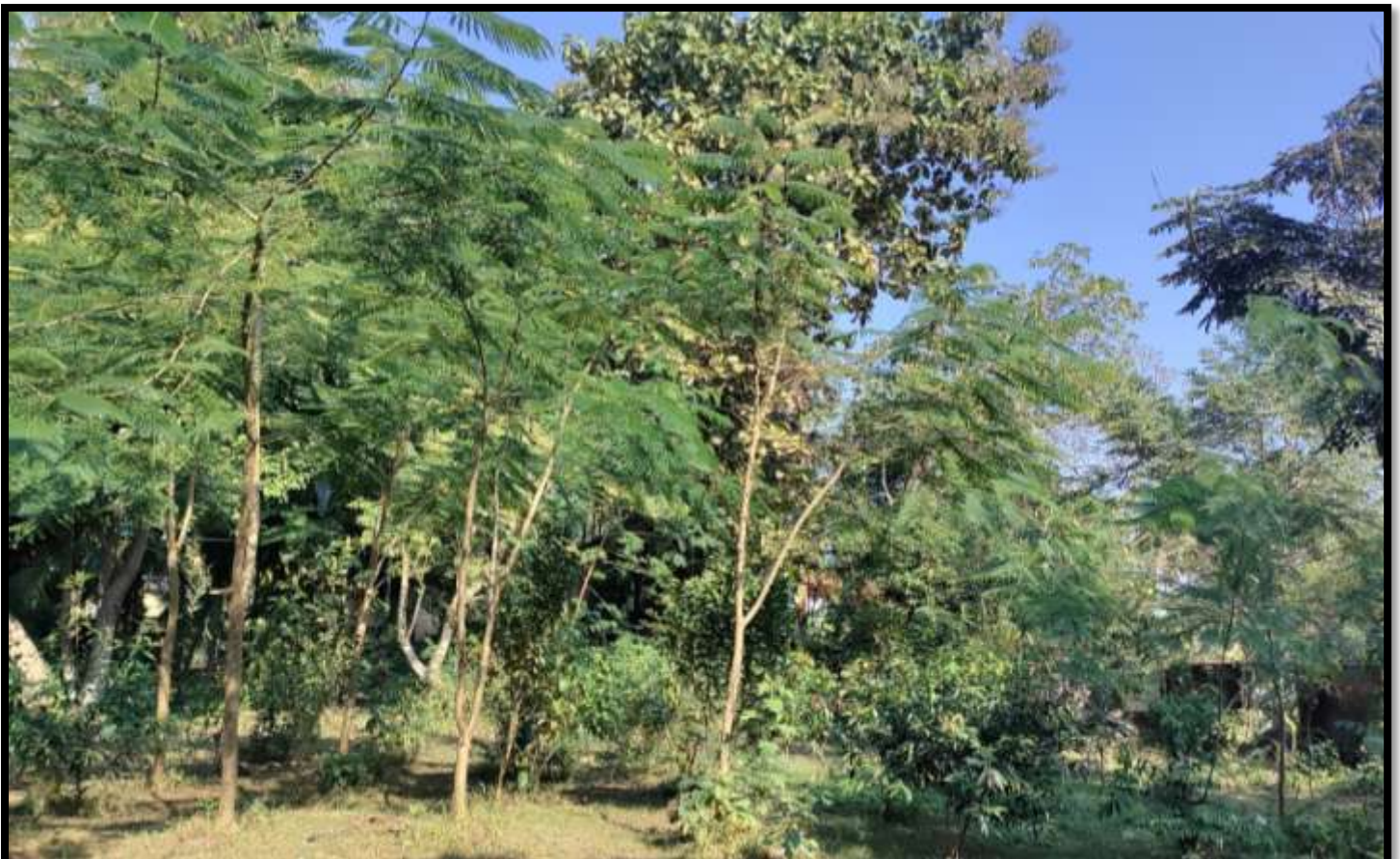
Planted on WED'2022, in BGR Township, Growth as on November,2023