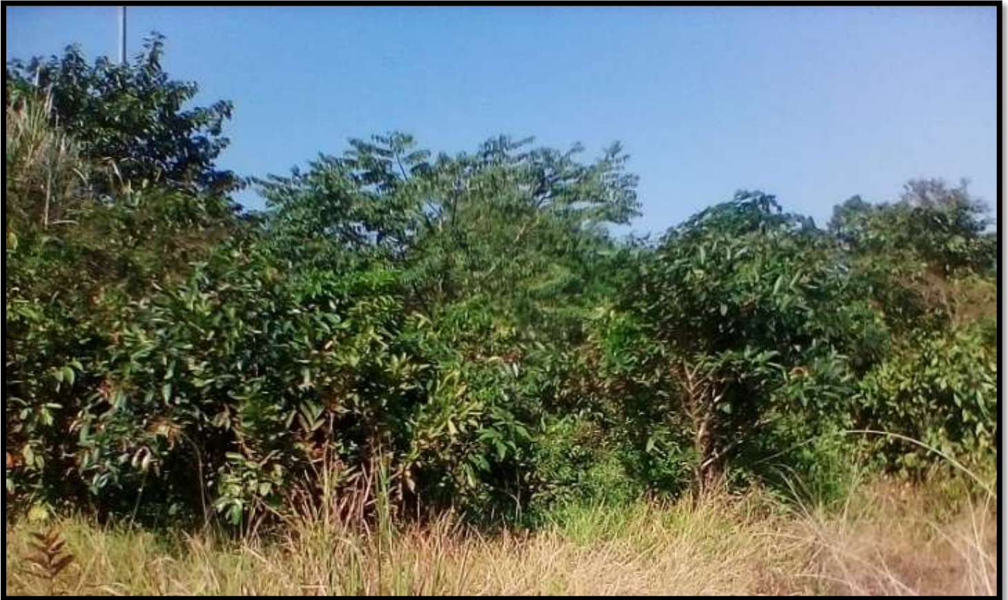
Planted on Aug,2021, in the complex, North side of new project(IndMax & BS-VI), Growth as on October,2023