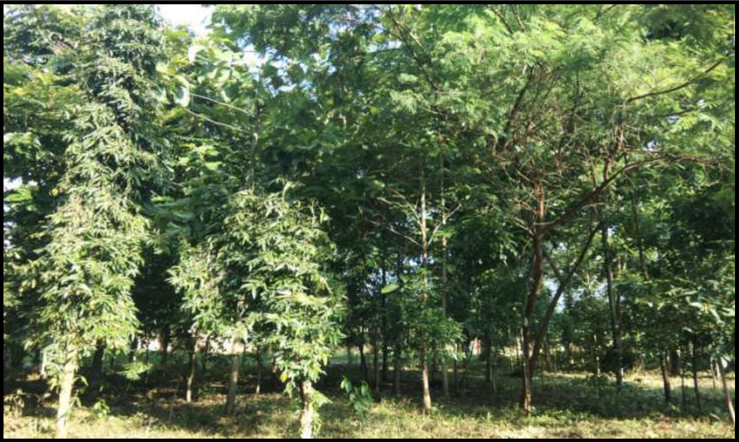
BGR TOWNSHIP PLANTATION, Planted Van mahotsav 2018, Growth as on November'2023