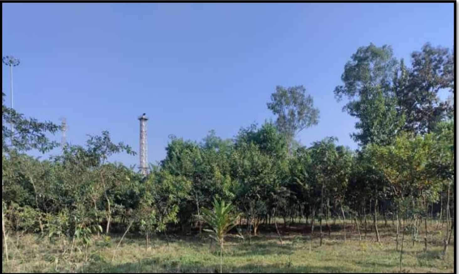
North Bongaigaon High School, 5250 Sapling Planted by Miyawaki Method in the month of September,2019, Growth as on September,2023.