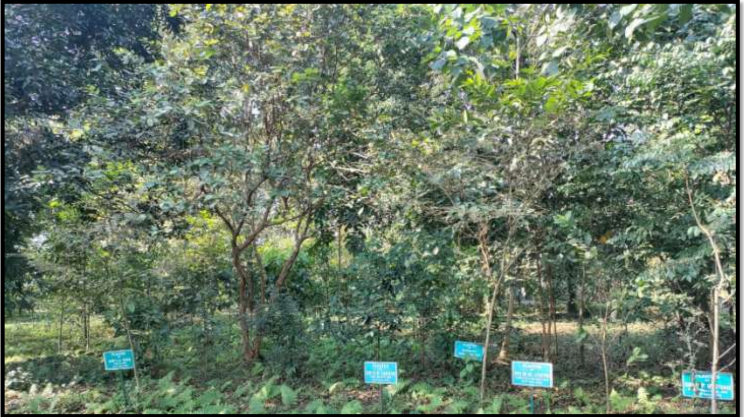
Planted on WED'2021, in BGR Township, Growth as on November,2023