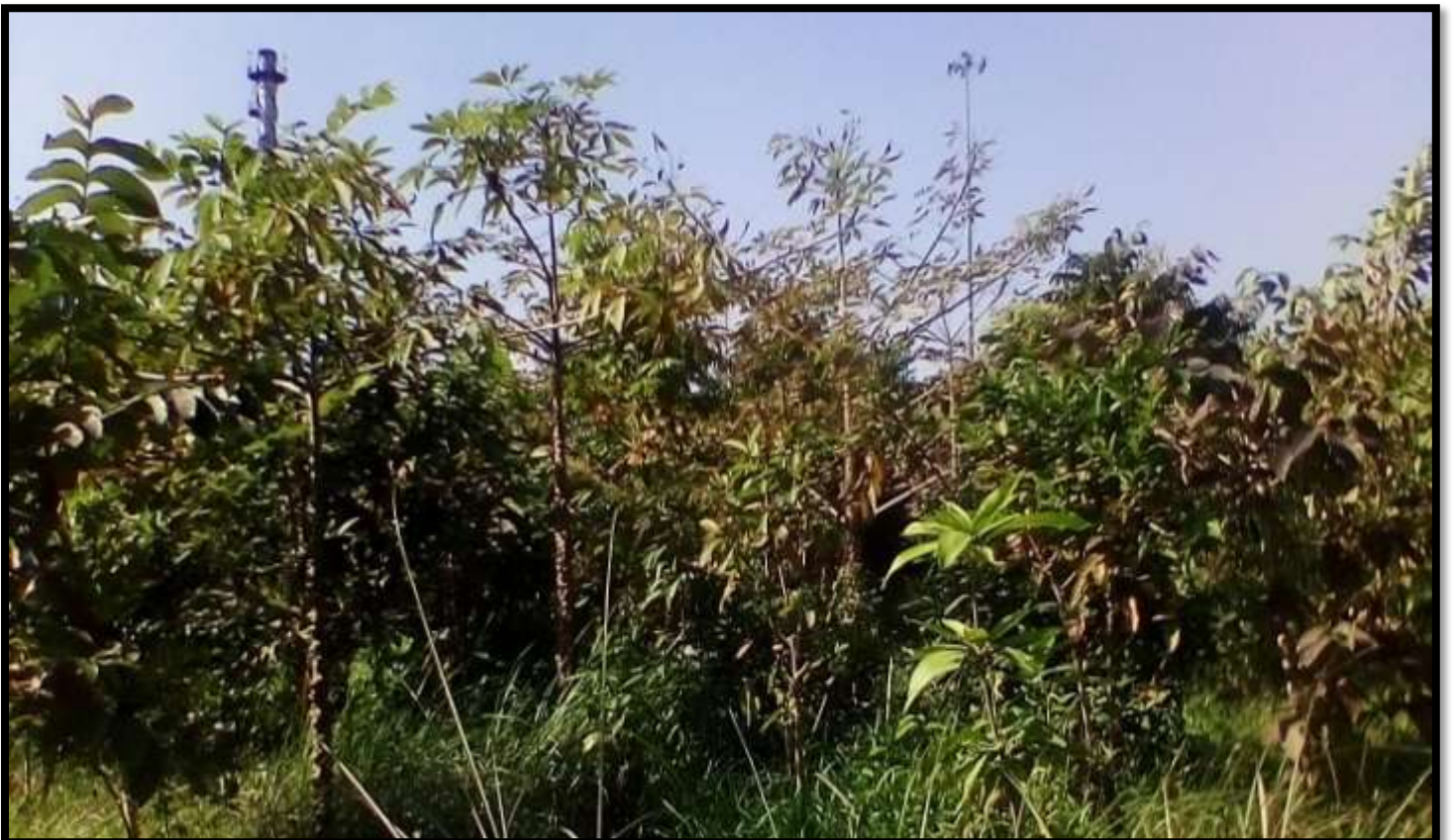
Planted on Aug,2021, in the complex, North side of new project(IndMax & BS-VI), Growth as on October,2023