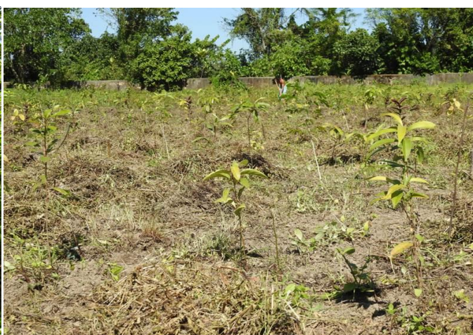
BIRHANGAON STATDISPENSARY PLANTATION