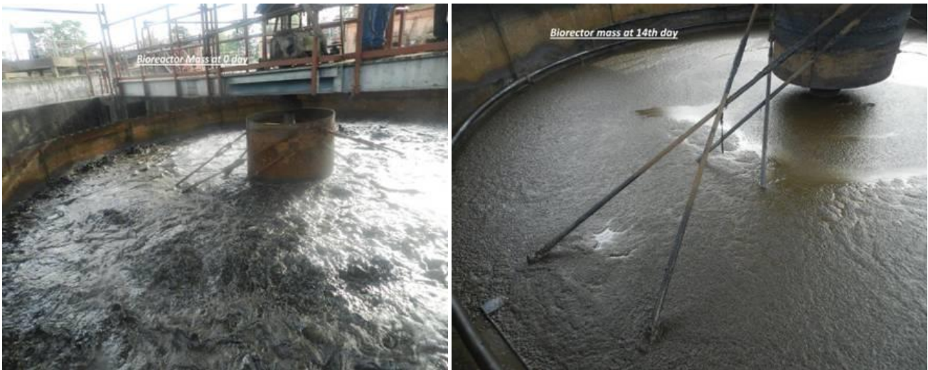
BIO-REMEDICATION FACILITY OF BGR

One old slurry thickener from Petrochemical section was converted to confined space bio-remediation reactor to treat oily sludge with help from IOCL-R&D. The process of bio-remediation started from July 2017 and at present per batch approximately 35 m3 of oily sludge is being processed.