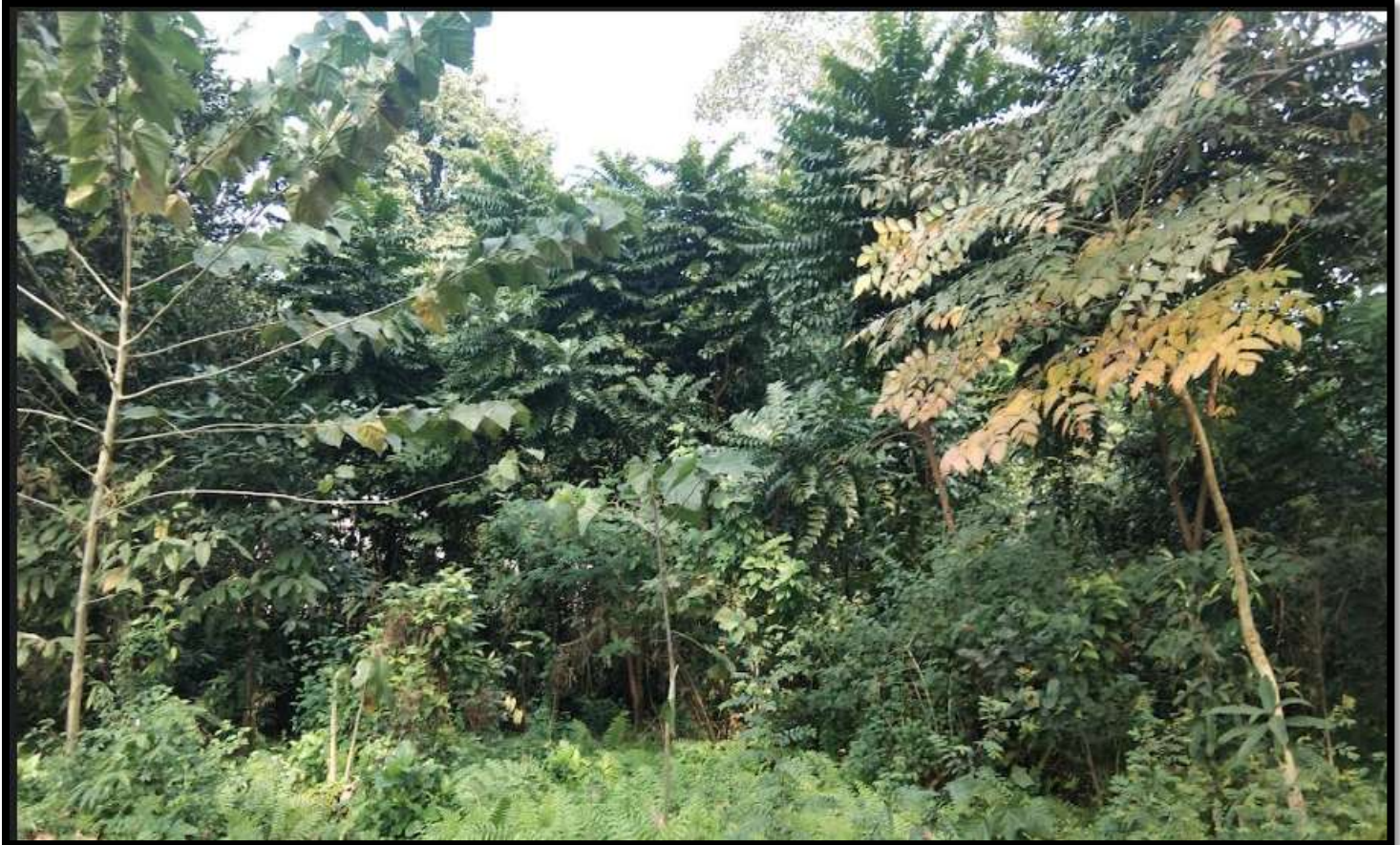
On WED'2020, 3740 nos. of sapling planted in BGR Township, Growth as on Nov,2022.