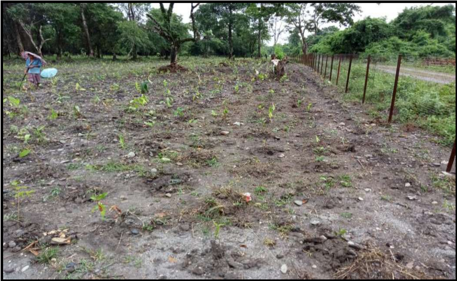
Part of Plantation at Amguri Forest Range, Koila Moila, In collaboration with DFO Chirang