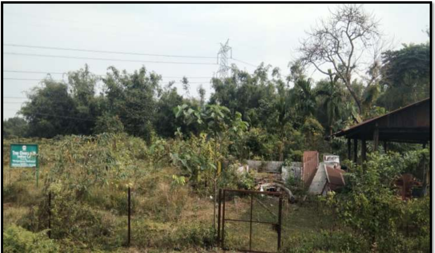
4810 nos of sapling Planted in the month of August'2020 at Hatipota Brahma Mandir, Growth as on Nov,2022.