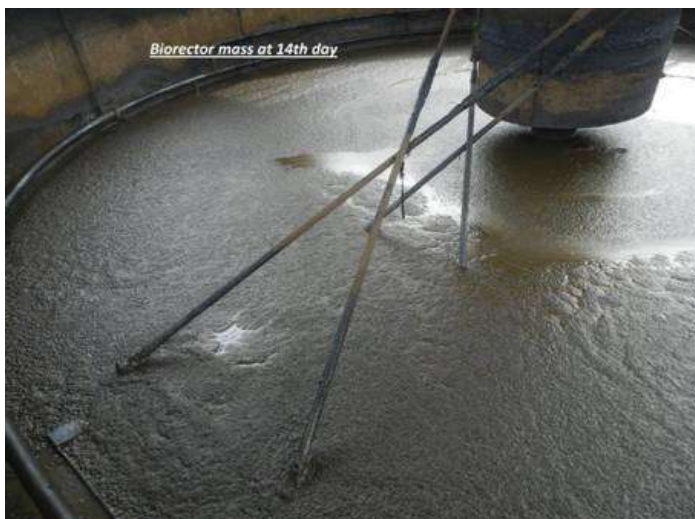
Bio-remediation facility of BGR

Further two more Rain Water Harvesting (Ground Water Recharging) schemes in BS-VI project have been implemented during 2019-20 and Two more implemented in the FY 2020-21 in Admn. building and BGR Township temple complex.