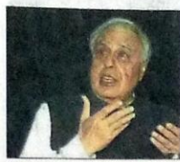
■ Kapil Sibal