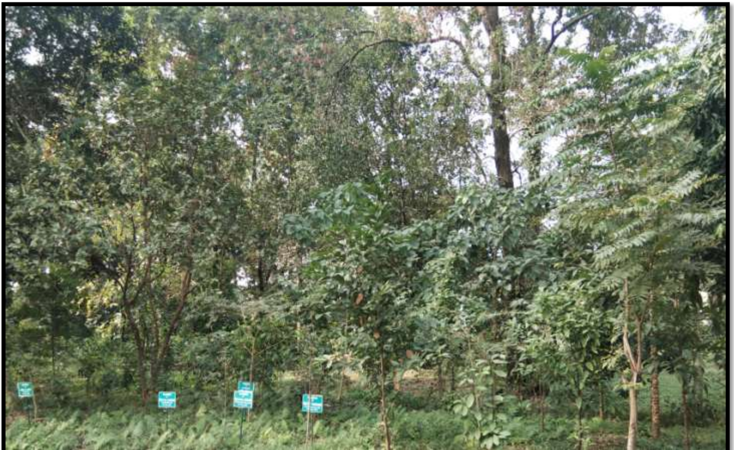
Planted on WED'2021, in BGR Township, Growth as on Nov,2022