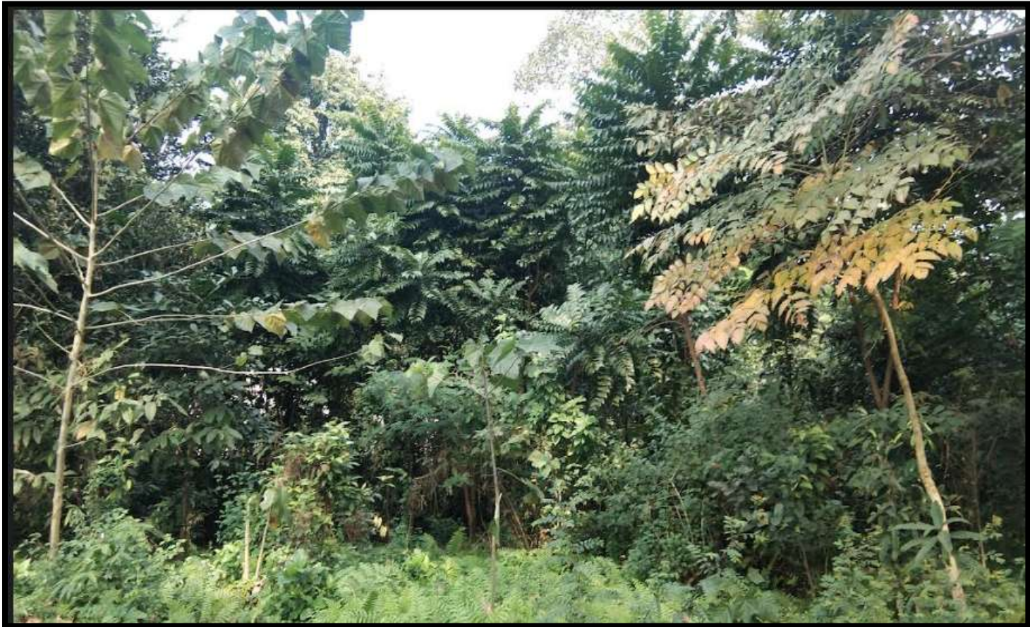
On WED'2020, 3740 nos. of sapling planted in BGR Township, Growth as on Nov,2022.