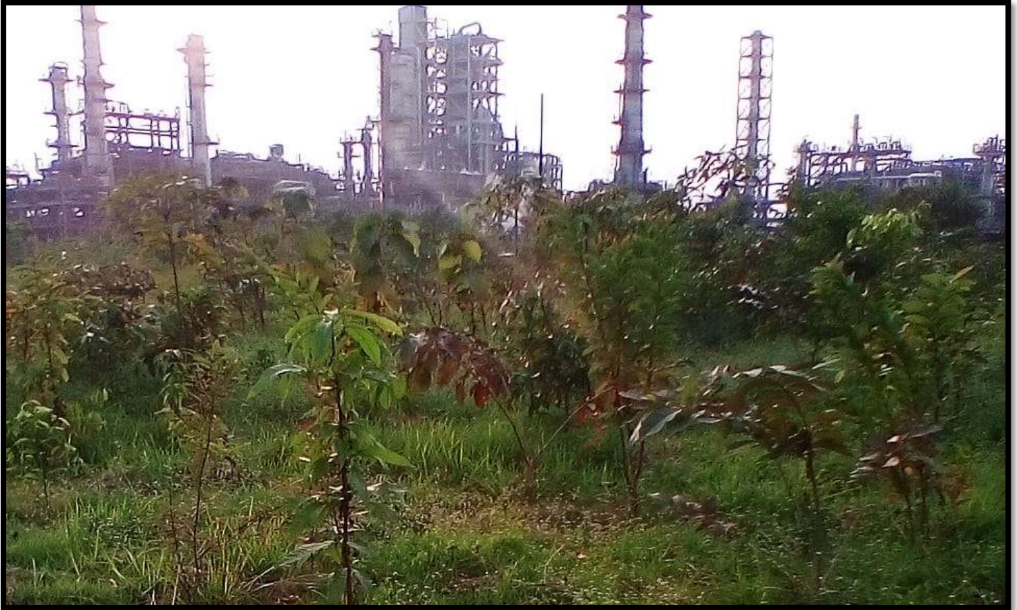
Planted on Aug,2021, in the complex, North side of new project(IndMax & BS-VI), Growth as on Nov,2022