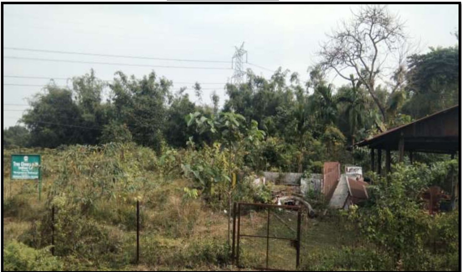
4810 nos of sapling Planted in the month of August'2020 at Hatipota Brahma Mandir, Growth as on Nov,2022.