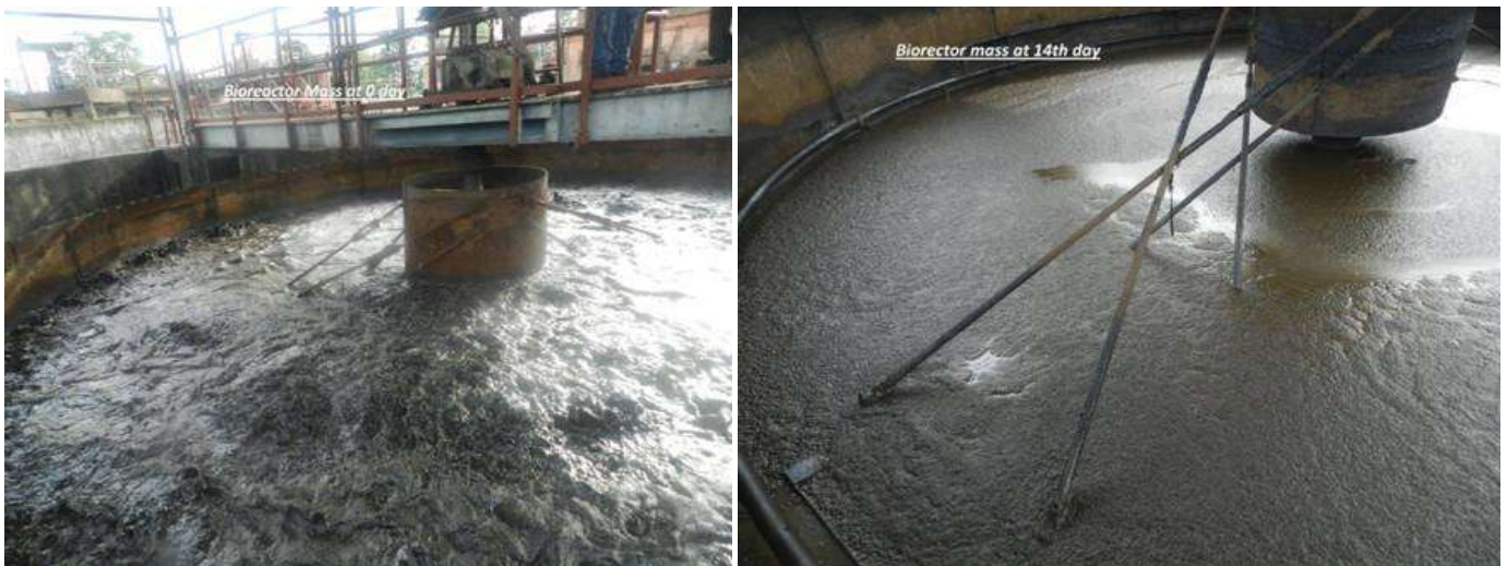
Bio-remediation facility of BGR

One old slurry thickener in ETP from Petrochemical section was converted to confined space bio-remediation reactor to treat oily sludge with help from IOCL-R&D. The process of bio-remediation started from July 2017. From 1 st April, 2022 to 30 th September, 2022 , 30.5 MT of oily sludge has been processed in the Bio-reactor.