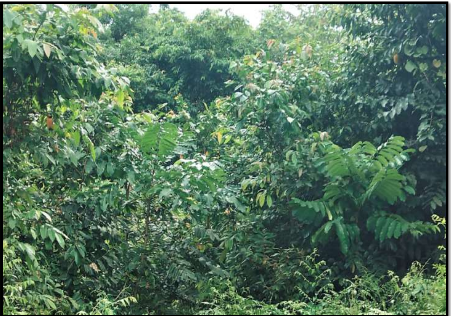
Birhangaon State Dispensary Plantation, 10,000 nos. Sapling Planted by Miyawaki Method in the month of August,2017. Growth as on May,2022