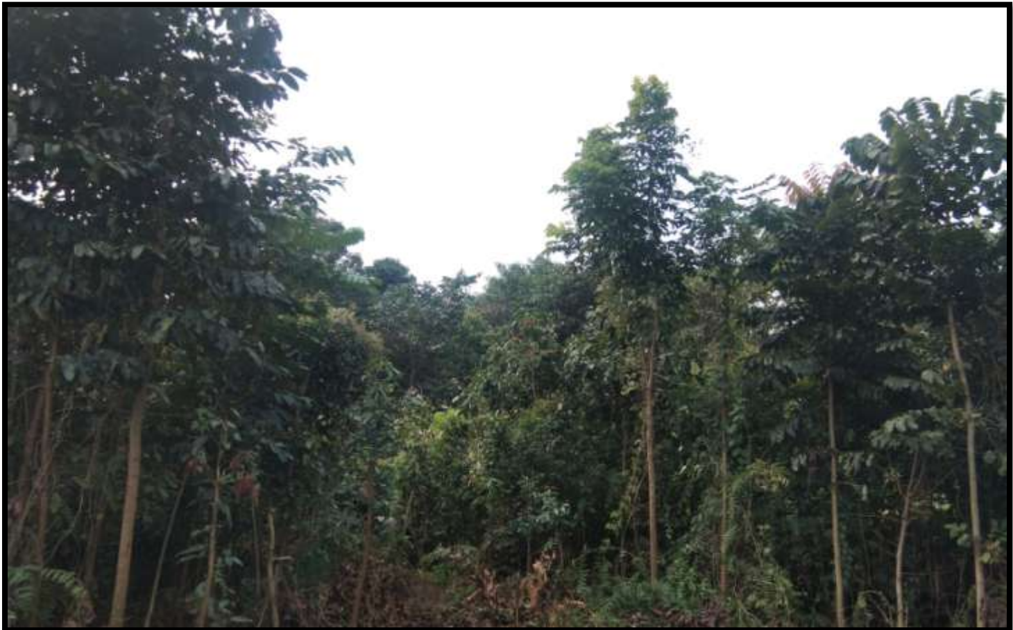
Birhangaon State Dispensary Plantation, 5375 nos. Sapling Planted by Miyawaki Method in the month of September,2019 Growth as on Nov,2022.