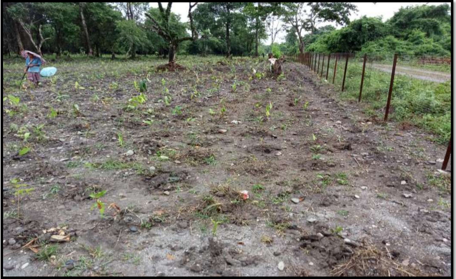
Part of Plantation at Amguri Forest Range, Koila Moila, In collaboration with DFO Chirang