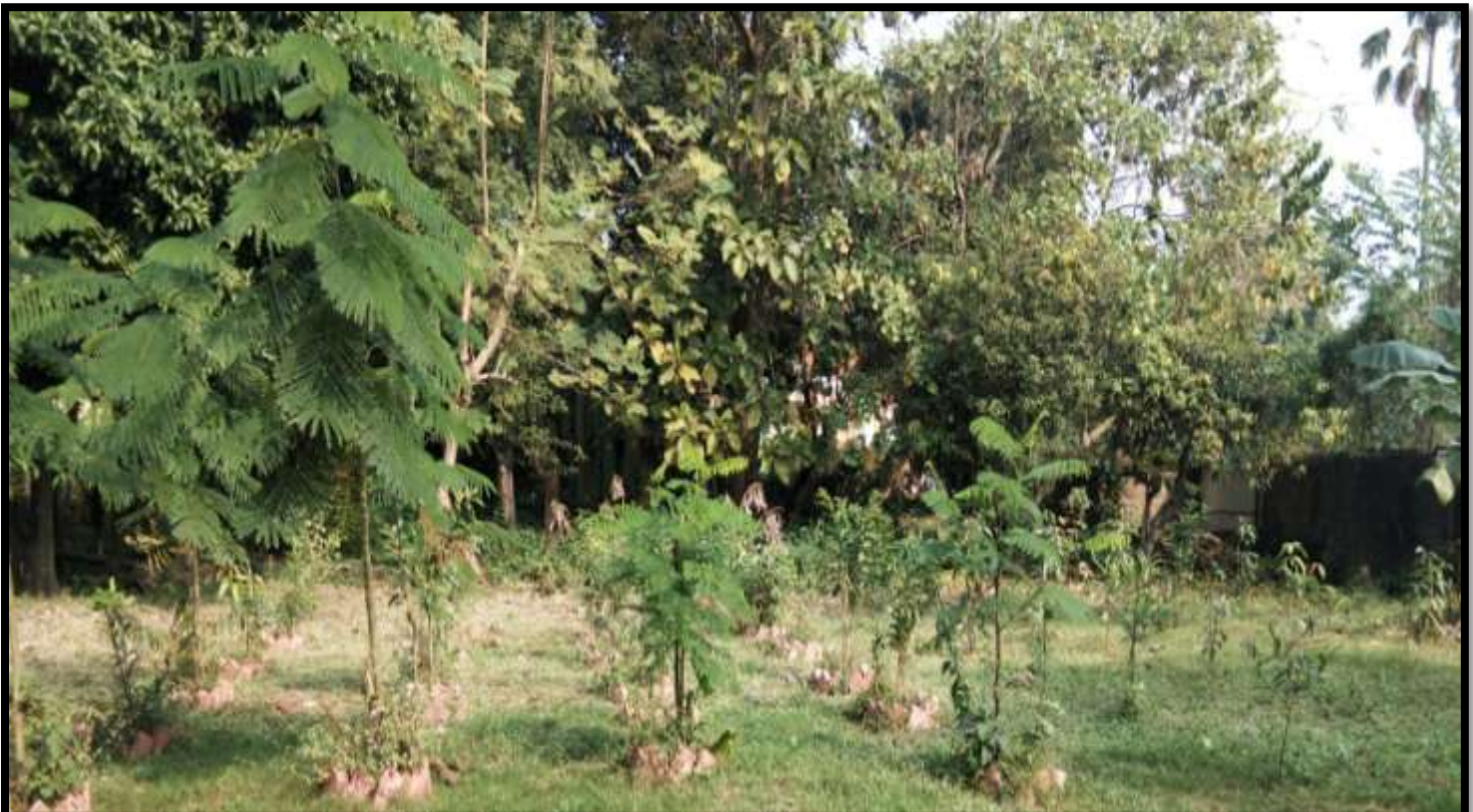
Planted on WED'2022, in BGR Township, Growth as on Nov,2022