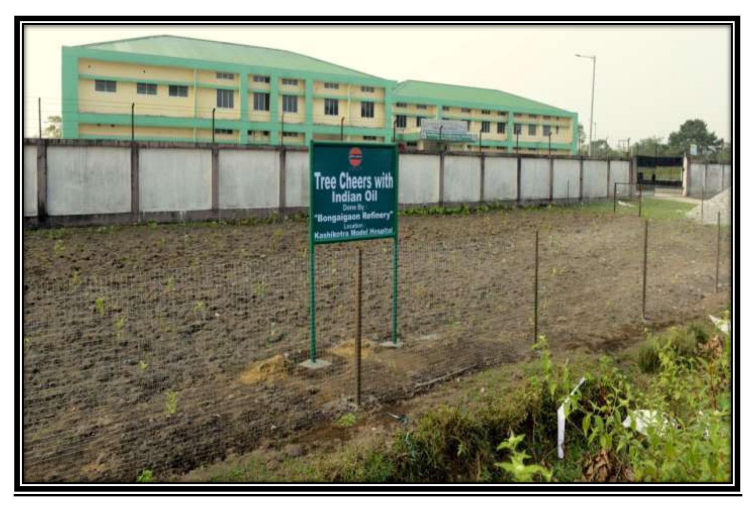
4000 nos of sapling planted at Kashikotra Model Hospital in Nov'2020