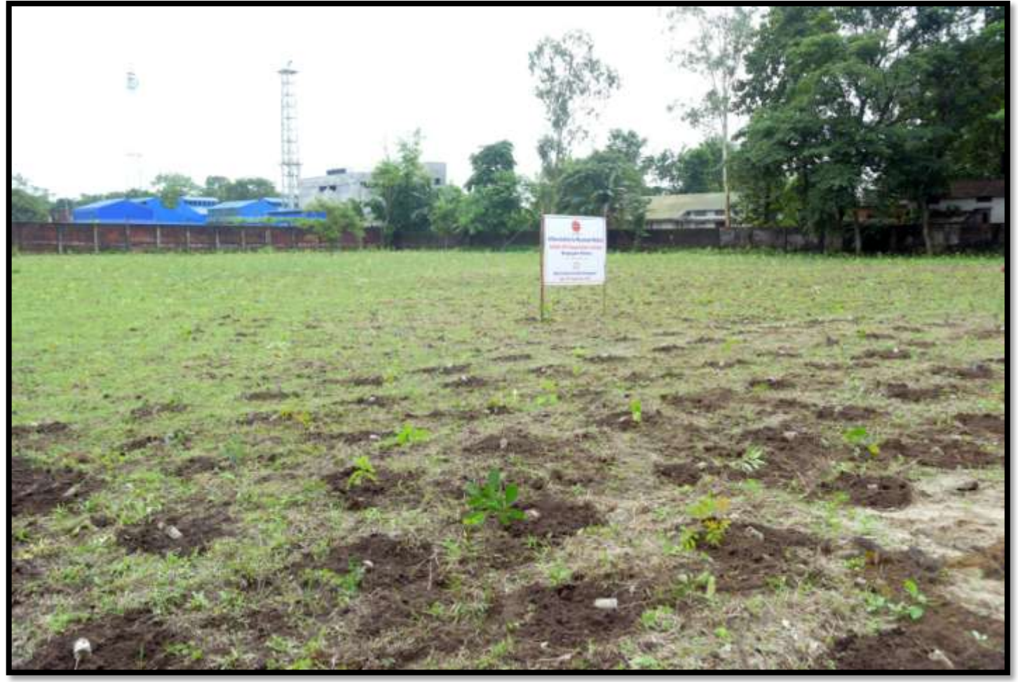
North Bongaigaon High School, 5250 Sapling Planted by Miyawaki Method in the month of September,2019