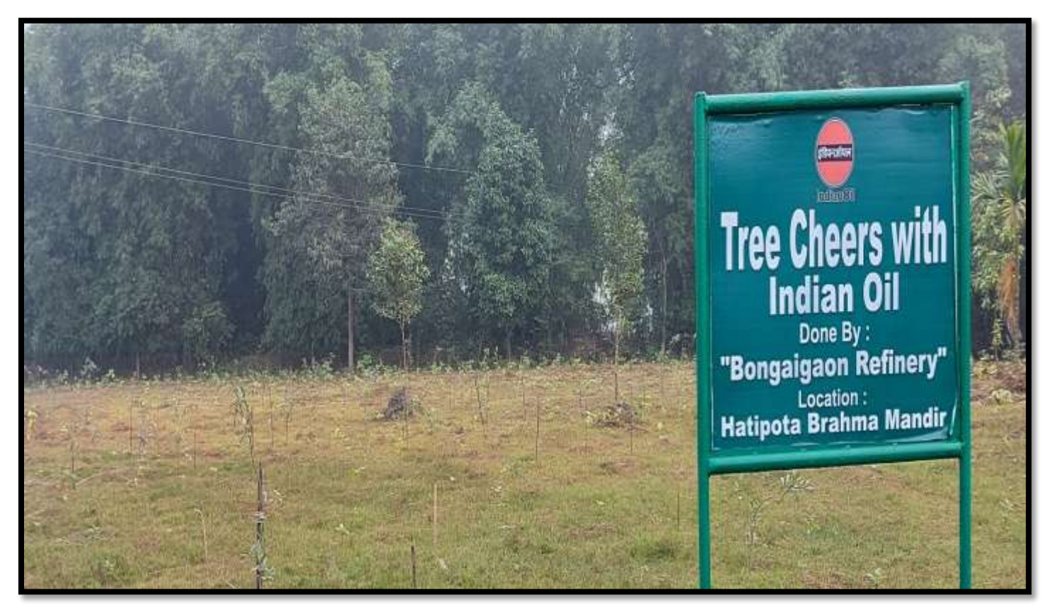
4810 nos of sapling Planted in the month of August'2020 at Hatipota Brahma Mandir.