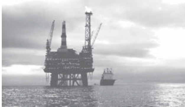
Exploring the high seas

Exploration & Production (E&P) business is an important area and a major breakthrough is awaited to reap returns from the Corporation's E&P investments made over the years. Not only has our portfolio of E&P assets, (both in India and abroad) increased, capabilities have been enhanced after we have taken on the role of an operator in newly-acquired E&P blocks.