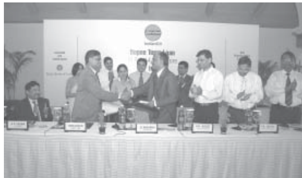
Recognition beyond boundaries - Financial Management.

Depreciation for the year 2009-10 was Rs.3,240 crore as against Rs.3,038 crore for the year 2008-09.