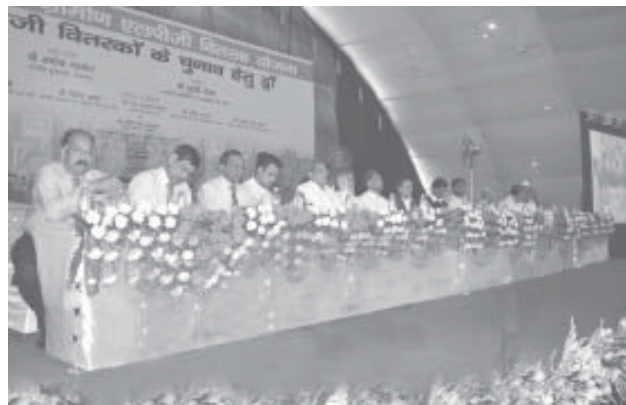
Launch of Rajiv Gandhi Grameen LPG Vitarak Yojana

A policy & regulatory framework has been evolving in the recent years to facilitate the development of gas pipeline infrastructure, especially in the context of increase in domestic gas production. During the year, the grant