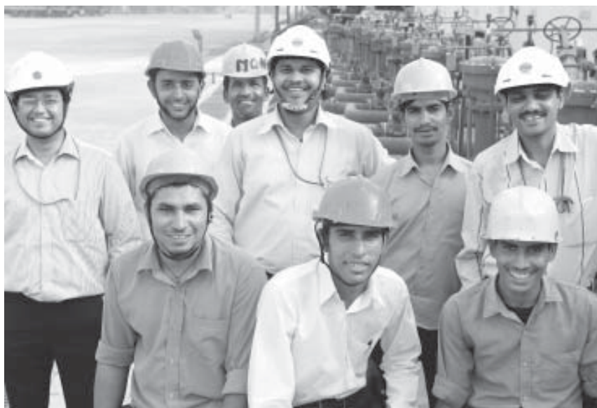
Dedication and Commitment, to the Nation and Society

To complete all planned projects within the scheduled time and approved cost.