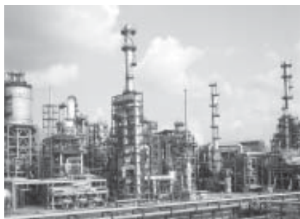
PX-PTA plant at Panipat

Note: Figures for the previous year have been regrouped, wherever necessary.