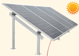
Solar PV Panel (Outdoor Unit)

Surya Nutan is designed based on a patented concept developed by IndianOil R&D Centre.