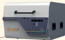
Solar Cooking System (Indoor Unit)