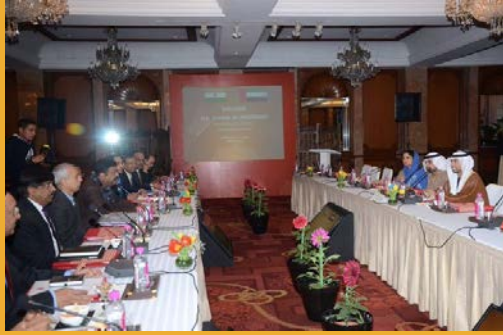
Petroleum Minister Shri Dharmendra Pradhan held a bilateral meeting with H. E. Suhail Mohammed Al Mazrouei, Minister for Energy of United Arab Emirates on February 10, 2016 in New Delhi. Read More...