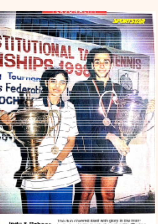
Indu & Baboor Industrial table tensis disreptoration Per page 751.